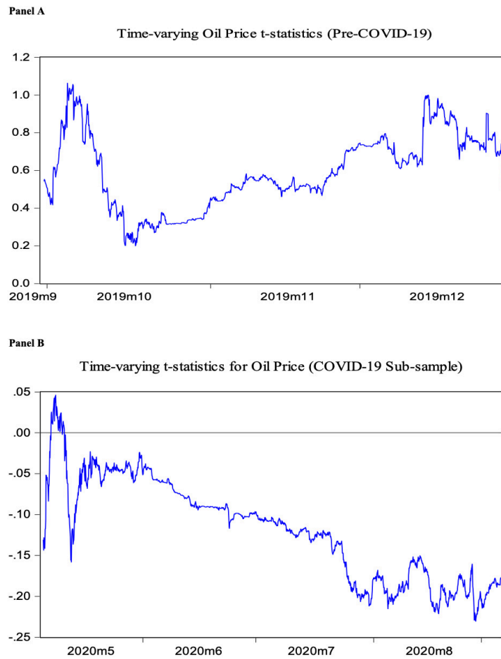
Figure 2: Time-varying t-statistics for sub-sample

This figure illustrates the regression results from the model, JPY\_RET_t = \alpha + \beta oil_{t-1} + \gamma(oil_t - oil_{t-1}) + \varepsilon_t . Here, JPY\_RET_t is the Japanese Yen in natural log percentage return form, oil_t is the WTI 1-month oil futures price, and \varepsilon_t is the disturbance term. We use a recursive window to estimate time-varying \beta coefficients. The first 50% of the data are used as an in-sample period and the model is estimated. We then increase the sample by one observation (by one-hour) and generate the second estimated \hat{\beta} . We use this process until the last observation of the data is used. Panel A indicates t -statistics against time for the pre-COVID-19 sample (01/07/2019 to 30/12/2019) and Panel B shows the t -statistics against time for the COVID-19 sample (31/12/2019 to 04/09/2020) respectively.